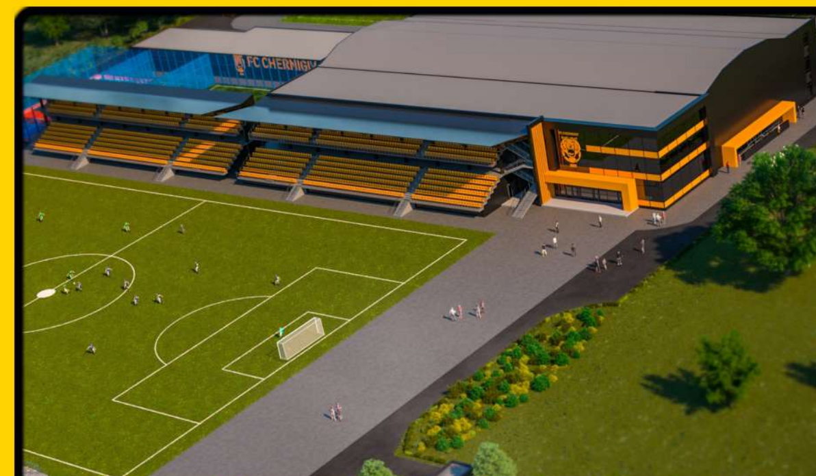
Project of a large sports complex. It will be the first such level stadium in Chernigiv