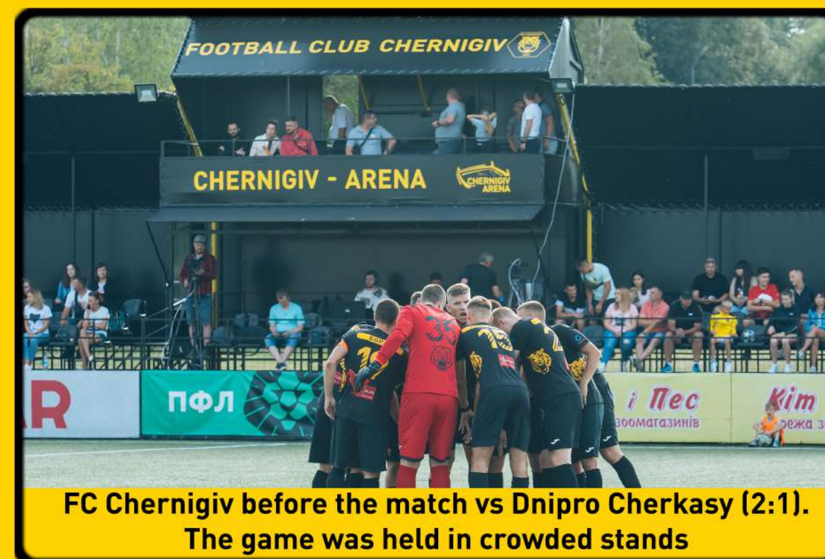
FC Chernigiv before the match vs Dnipro Cherkasy (2:1). The game was held in crowded stands