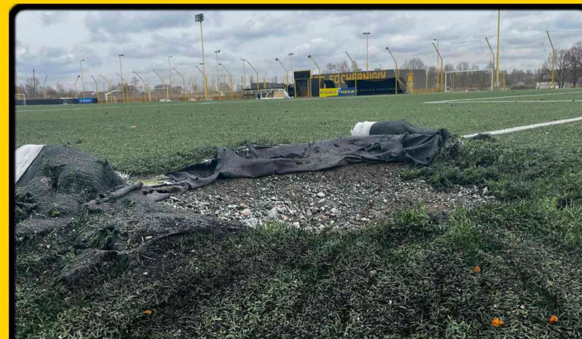
One of the many damages of the stadium's field