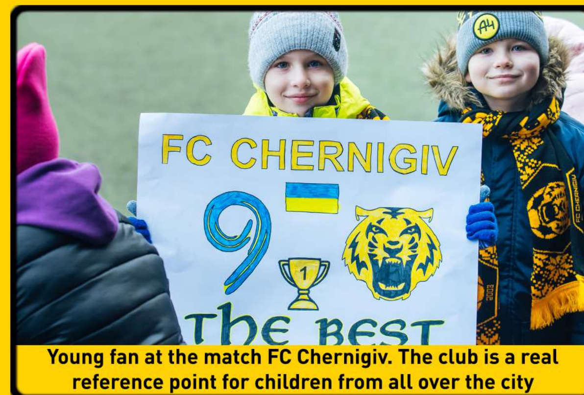
Young fan at the match FC Chernigiv. The club is a real reference point for children from all over the city