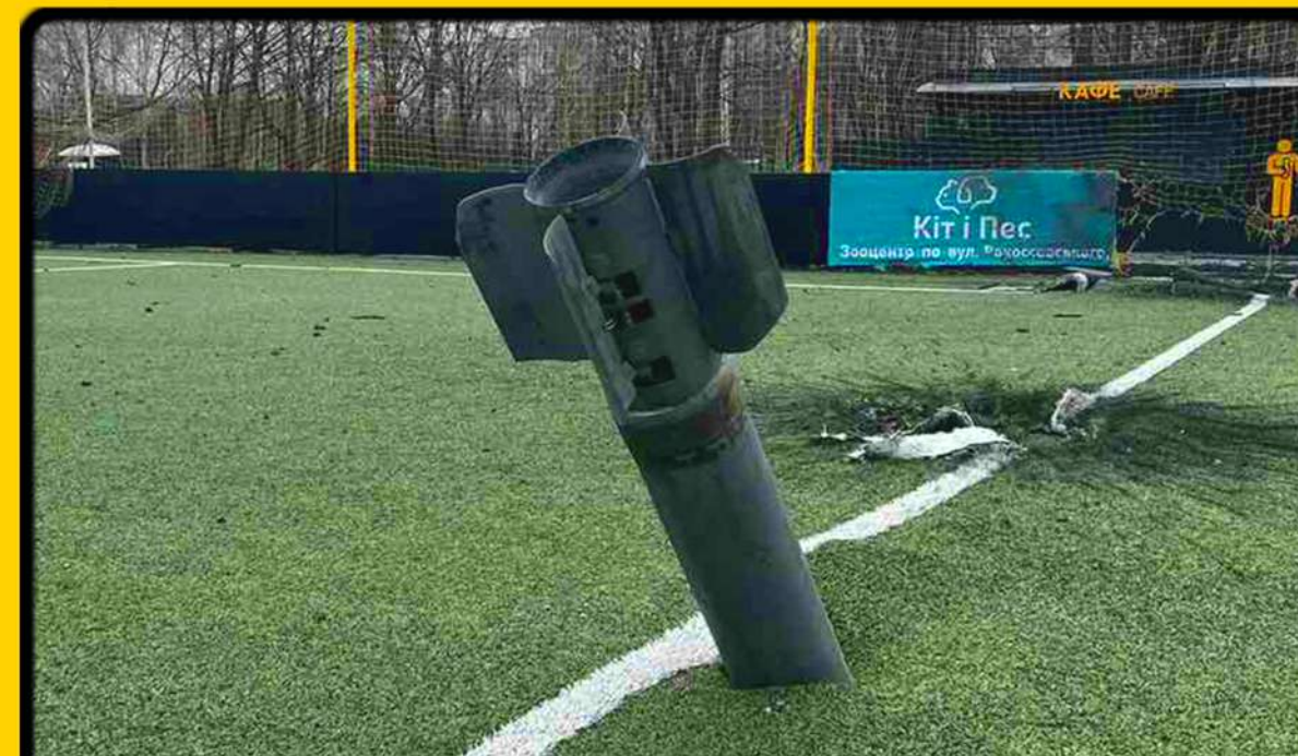
Rocket from the BM-30 Smerch (MRL 280mm M1983), which Russians fired Chernigiv-Arena

The stadium is very important for the city - in fact it's the only sports facility of this level in Chernigiv. At the same time, by joint efforts, when receiving help, it can be relatively quickly not only rebuilt, but also brought to a new level.