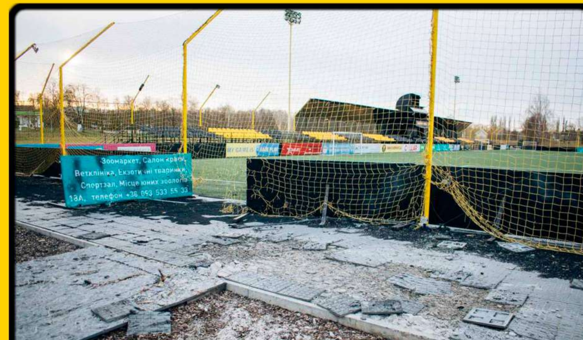
The tracks for the fans are destroyed by fragments of mines and shells