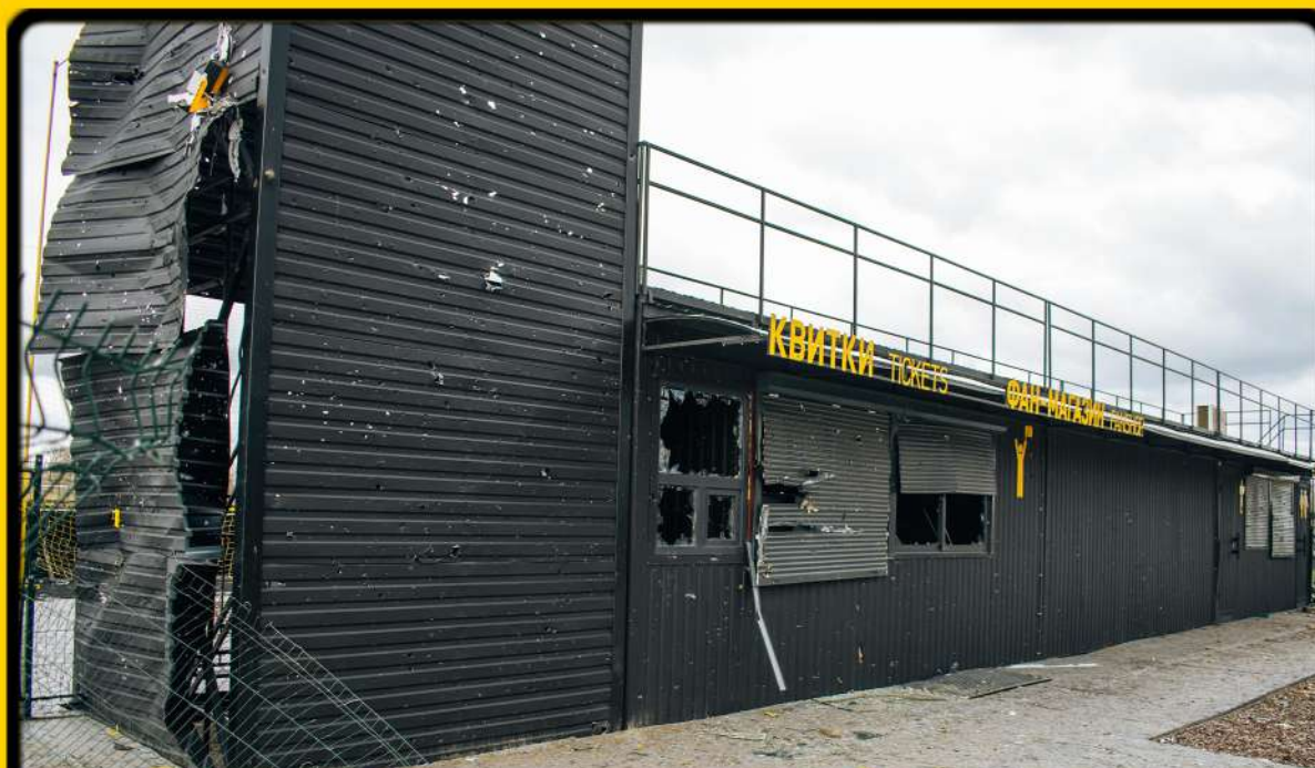
Destruction of buildings at the entrance